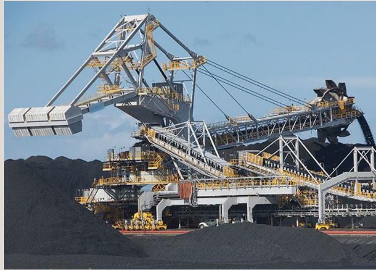
NCIG Coal Export Terminal (Newcastle, NSW, Australia - 2011-2013)