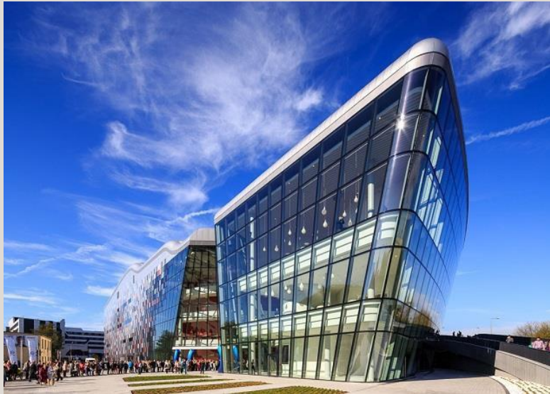
ICE Kraków Congress Centre (Poland - 2014)

● Airports ● Appliances ● Buildings ● Furnitures ● Bridges ● Chemical & Fertilizer Plants ● Ports & Harbours ● Pipelines ● Power Plants