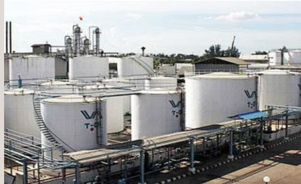
Verasuwan oil & gas facilities