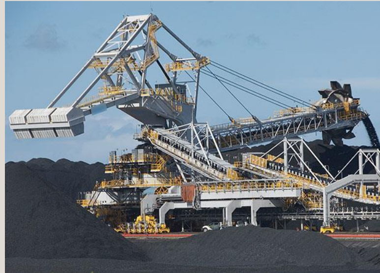
NCIG Coal Export Terminal (Newcastle, NSW, Australia - 2011-2013)