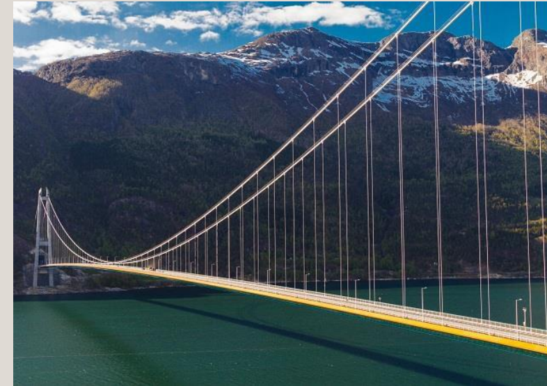
Hardangerbrua (Norway - 2013)