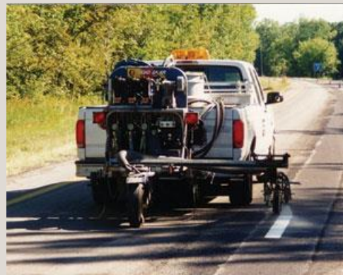
Truck Mounted Striper